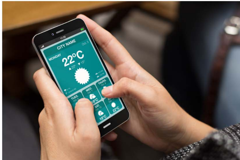
A Weather Report on a Smartphone

The National Weather Service is a government group that studies weather. The group informs people about weather and helps them prepare. Scientists called meteorologists work for the National Weather Service. Meteorologists use satellites in space and other tools to study weather. Meteorologists report what weather is coming to different areas. Some meteorologists give weather reports on TV or radio. People can listen to these reports and know what weather to expect. People can use their smartphones, tablets and computers to look at weather reports on National Weather Service websites and apps. The website below can help you learn about weather in your area.