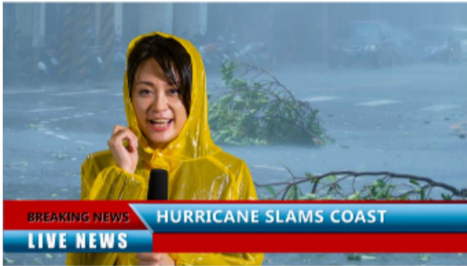
A Meteorologist Reporting Dangerous Weather

Do you sometimes have dangerous weather in your area? People across the U.S. may experience dangerous weather and need to be prepared. September is National Preparedness Month. A National Weather Service program called Weather-Ready Nation helps people prepare for dangerous weather. Weather-Ready Nation has a website that includes information, pictures and videos. People can use the website to learn about dangerous weather that could be nearby. They can learn how to prepare for this weather too. Being prepared can help people be safe!