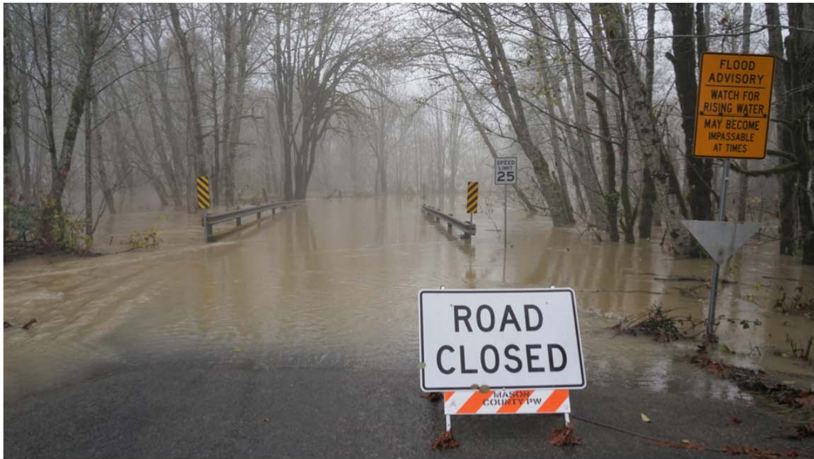
A Flooded Road

Dangerous weather can affect everyone. It can hurt people and destroy buildings! The most common kinds of dangerous weather are flooding, lightning, fog, wind and extremely hot or cold temperatures. You can talk to your parents and teachers about what to do at home and school during dangerous weather. This week's News-2-You® Extension Activity, located on the main web page, can help too. It has information about being prepared, and explains helpful phrases like “when thunder roars, go indoors” and “turn around, don’t drown.” These phrases remind you of ways to stay safe. Click on the Weather-Ready Nation website link below to learn much more!